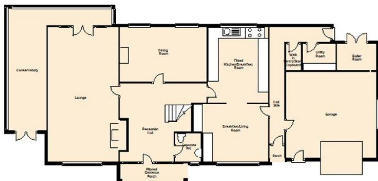
Ground Floor Approx. 176.9 sq. metres (1902 sq. ft.)