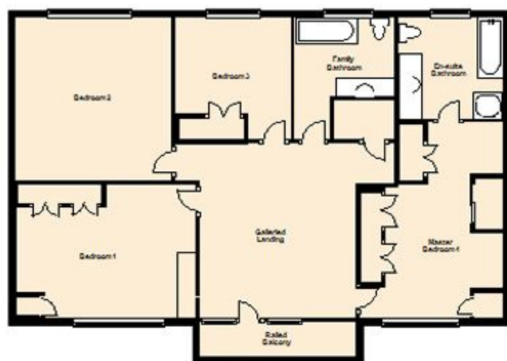
First Floor Approx. 108.7 sq. metres (1160 sq. ft.)