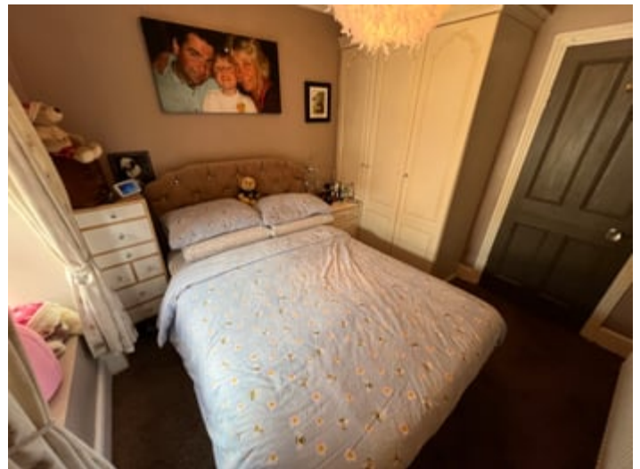
9' 8" x 8' 8" (2.95m x 2.64m) double glazed windows to side, central heating radiator, fitted cupboards. Door into -