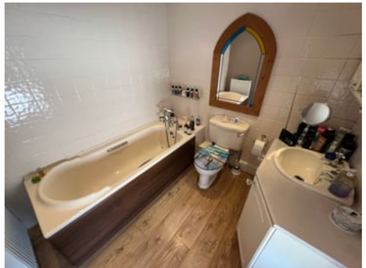
7' 0" x 7' 4" (2.13m x 2.24m) a white suite comprising of a panelled bath with hot and cold taps and shower head, vanity unit with inset wash hand basin, low level flush w.c. central heating radiator, spot lights to ceiling, frosted window to side, extractor fan, tiled walls.