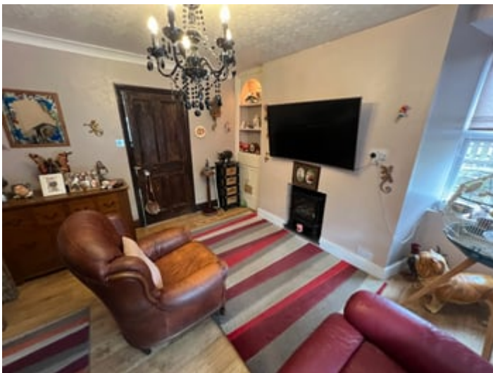
12' 6" x 14' 3" (3.81m x 4.34m) with dual aspect windows to front and side, central heating radiator, fireplace with slate hearth, alcove cupboard.