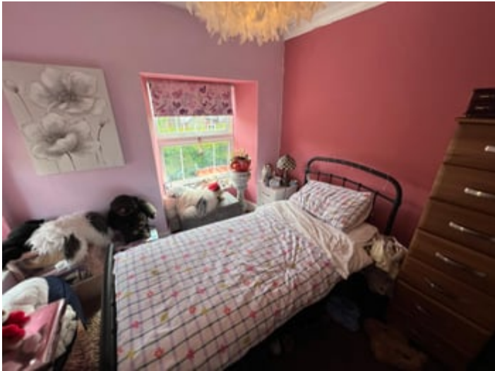
9' 2" x 10' 7" (2.79m x 3.23m) with dual aspect windows to front and side, central heating radiator.