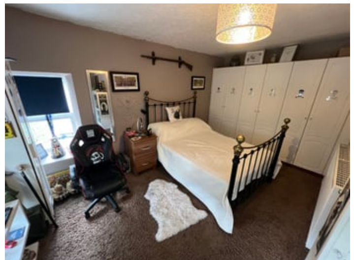
15' 9" x 16' 0" (4.80m x 4.88m) with dual aspect double glazed windows to front and side with lovely countryside views, central heating radiator, range of fitted wardrobes.