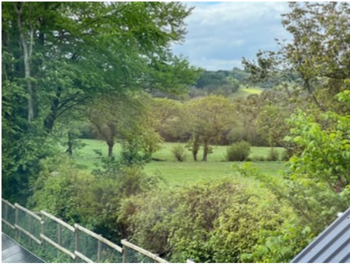
Front Bedroom 2