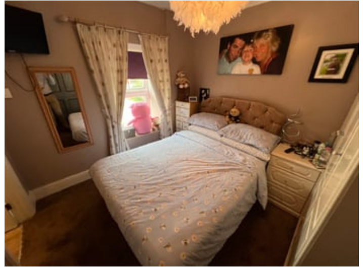
Master Bedroom 3