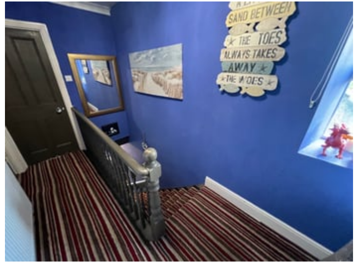
12' 0" x 5' 9" (3.66m x 1.75m) with central heating radiator, hatch to loft.