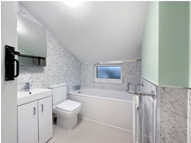
Four-Piece Family Bathroom