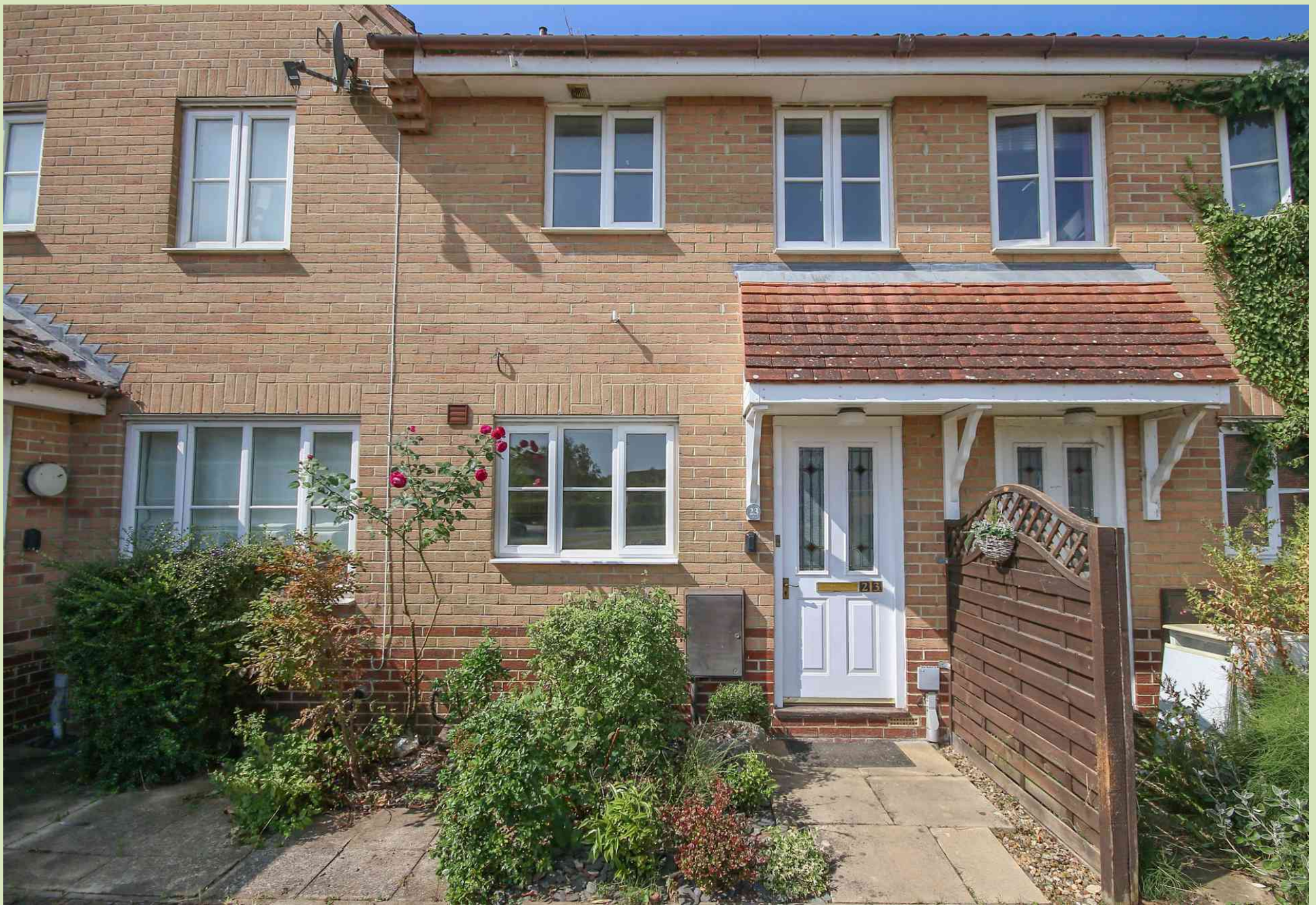
23 Bader Close , King's Lynn Guide Price £189,950