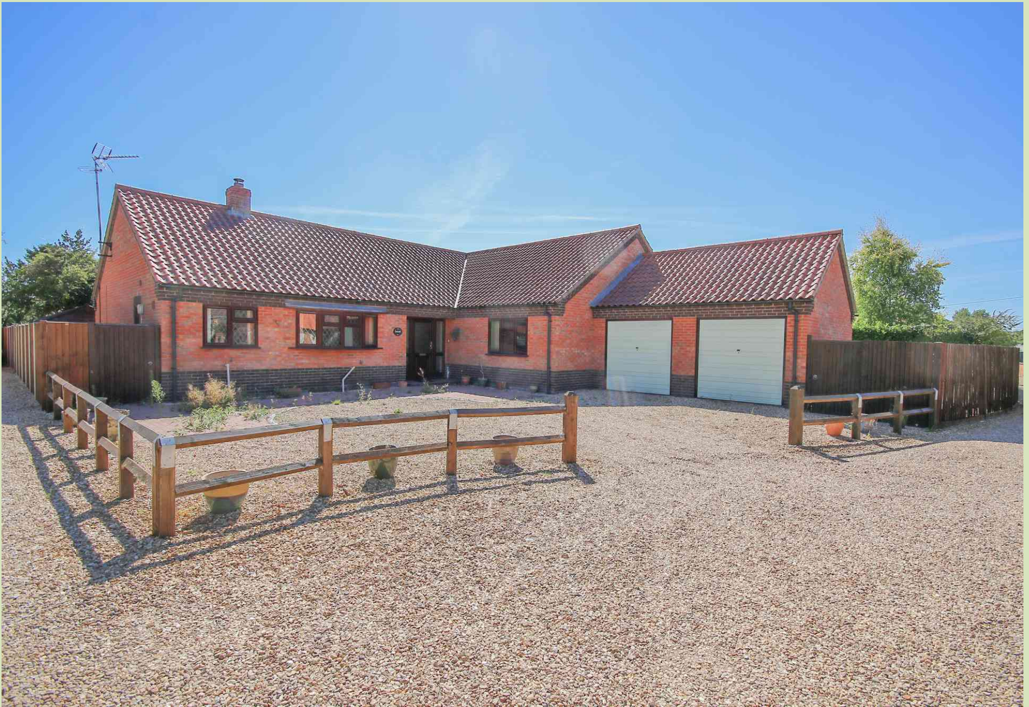
12d Chequers Lane, North Runcton Guide Price £450,000