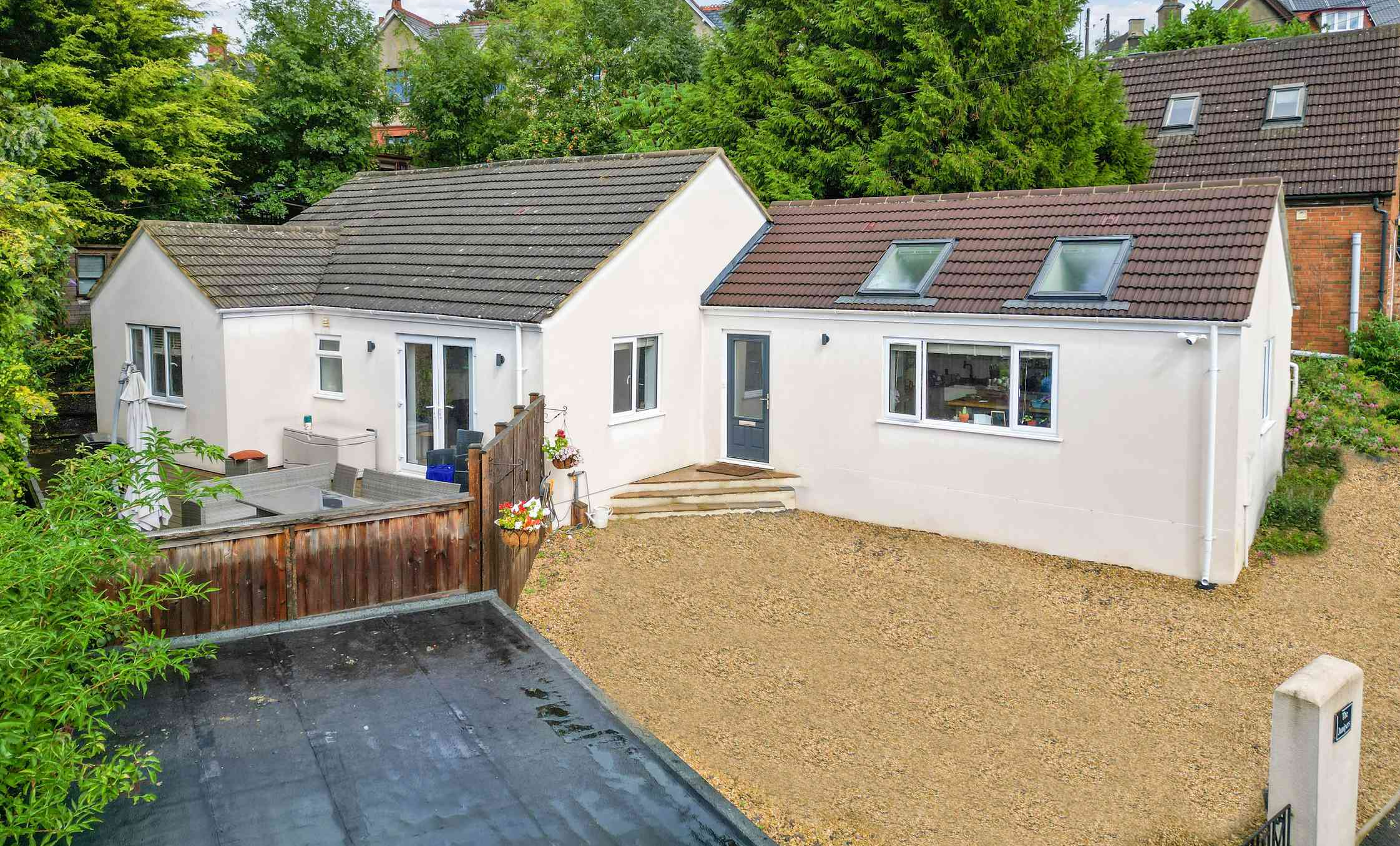
The Junipers, Carlton Gardens, London Road, Stroud, Gloucestershire, GL5 2AH Guide Price £525,000