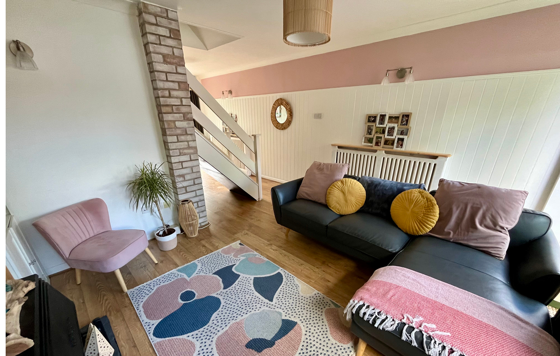
38 Saville Crescent, Ashford, Surrey TW15 1SX £399,950 - Freehold