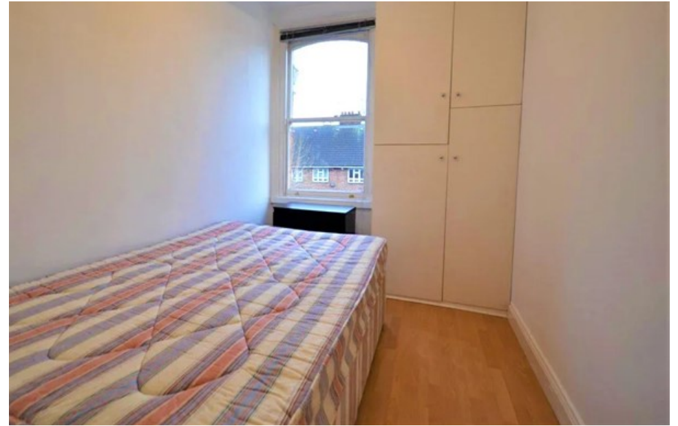
Buckley Road, Kilburn, London NW6 7NE £500,000 - Leasehold