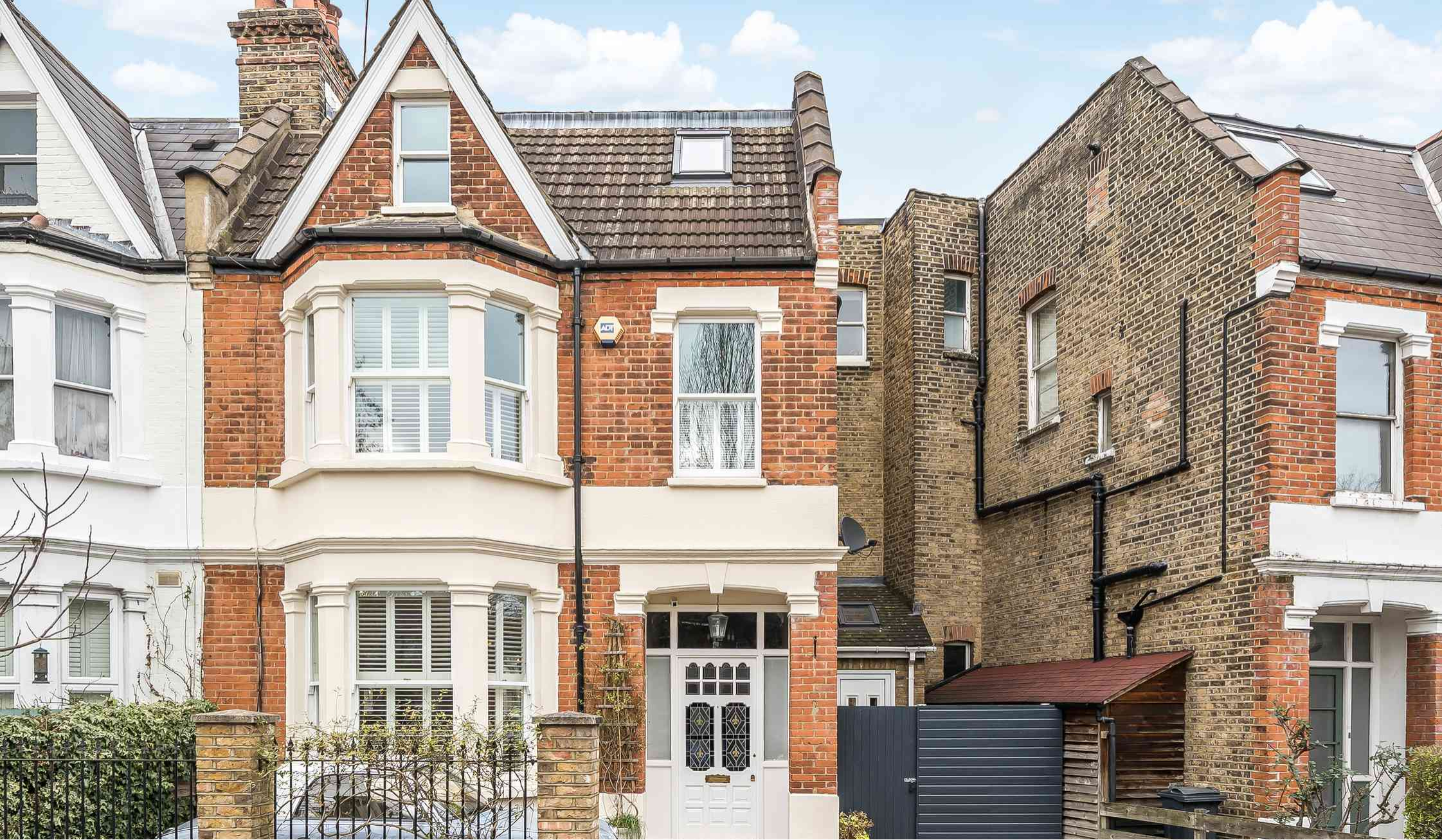
Stile Hall Gardens, London, W4 3BS