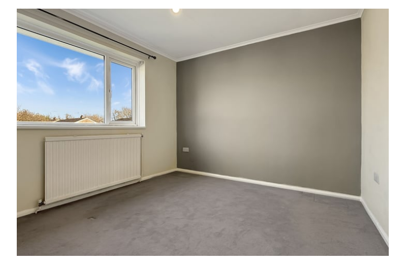
3.16m x 3.11m (10' 4" x 10' 2")