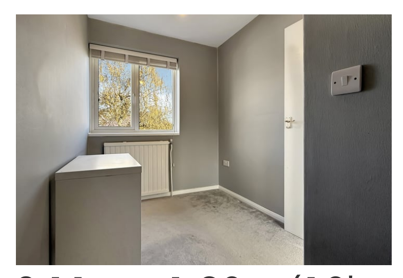
3.11m x 1.90m (10' 2" x 6' 3")