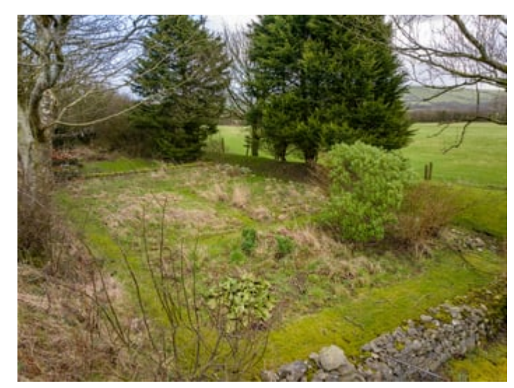
To the side of the outbuilding is a large vegetable patch with raised beds.

12' 6" \times 9' 9" (3.81m \times 2.97m) currently used as a coal house with side window and door to front.