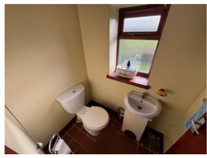
WC, single wash hand basin, side window, quarry tiled flooring.