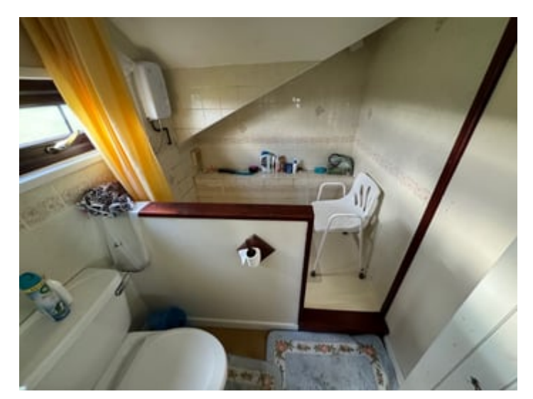
7' 5" x 5' 9" (2.26m x 1.75m) with walk-in shower, WC, radiator, rear window.