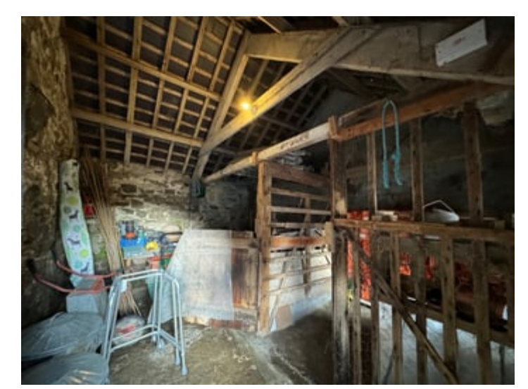
14' 0" x 12' 2" (4.27m x 3.71m) exposed 'A' frames and beams to ceiling, concrete base, window to front.