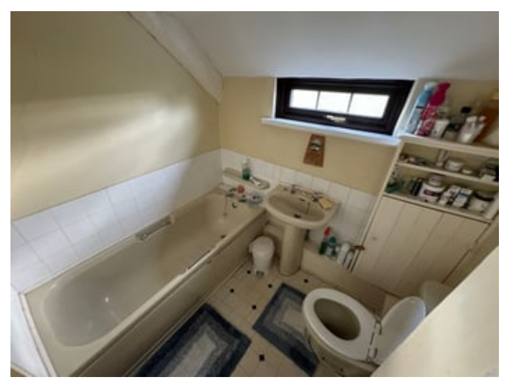
5' 8" x 6' 9" (1.73m x 2.06m) panelled bath, single wash hand basin, WC, heated towel rail, side window.