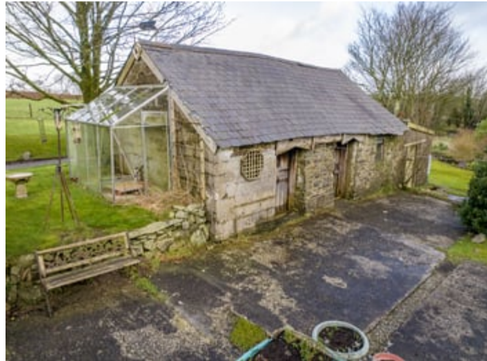
Of stone construction with a slated roof, split into 2 separate rooms: