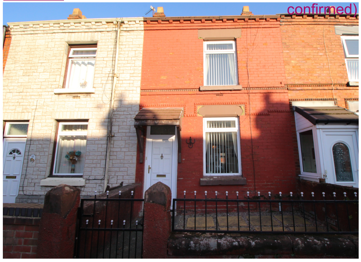
Nutgrove Road, St Helens, MerseysideWA9 £114,950