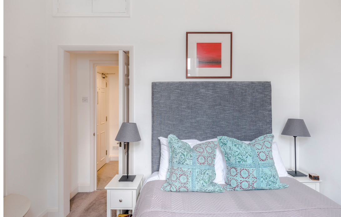
Flat 3 53 York Street, London, W1H 1PU £2,361.67 pcm