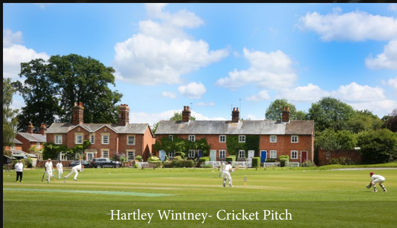
Hartley Wintney- Cricket Pitch

There are lovely walks nearby at the Basingstoke Canal which provide wonderful opportunities to explore countryside steeped in history.