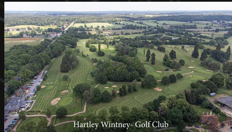
Hartley Wintney- Golf Club