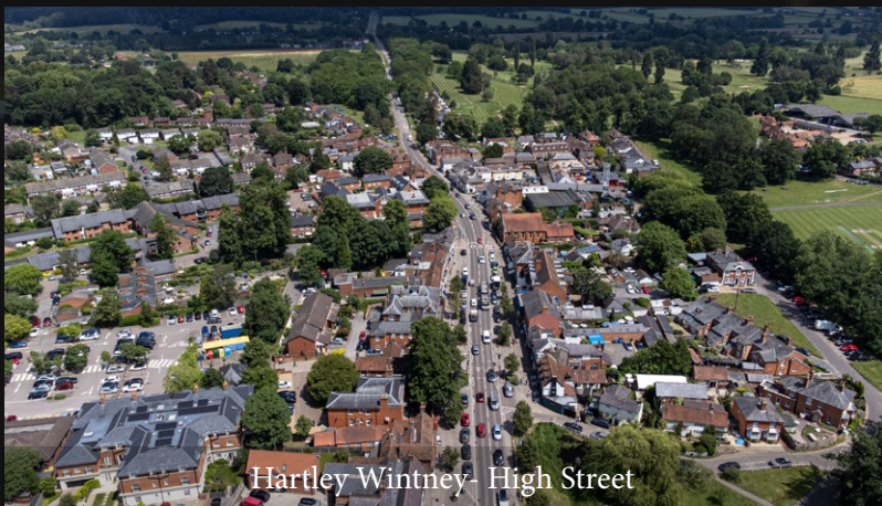
Hartley Wintney- High Street