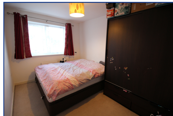
Eddleston Way, Tilehurst, Reading, Berkshire. RG30 4GY.