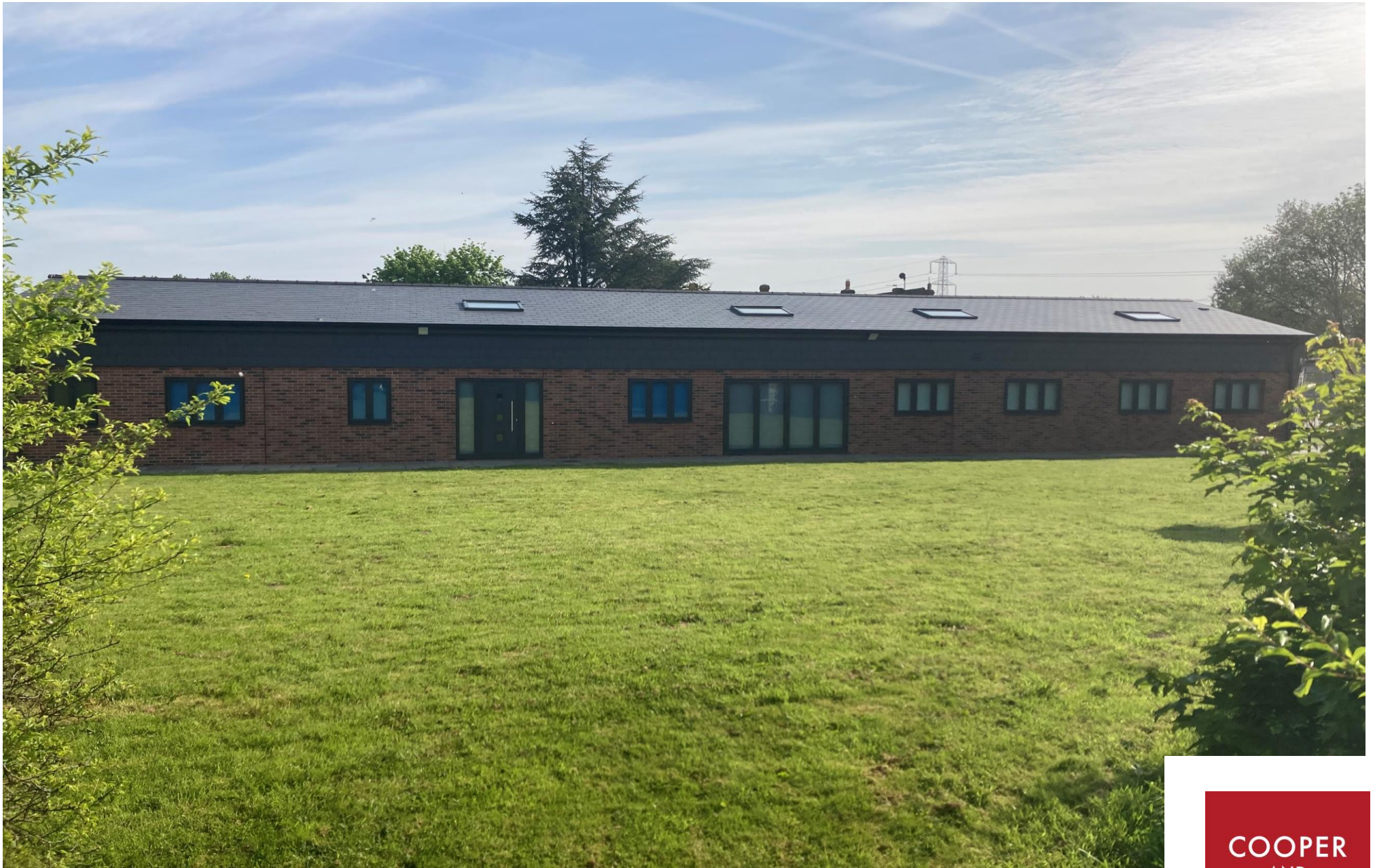
The Hay Barn, Feltham, Frome BA11 5NA