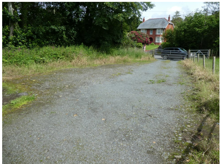
Is a fenced off entrance and a gated drive.