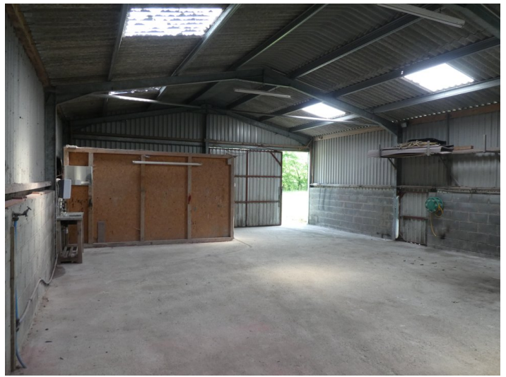
To the Front -

The vendor would consider letting the property by dividing into two sections - keeping one for his own use and letting the other half (approx 45' x 50') on a Long Term Let. - Rental Guide £500 per calendar month.