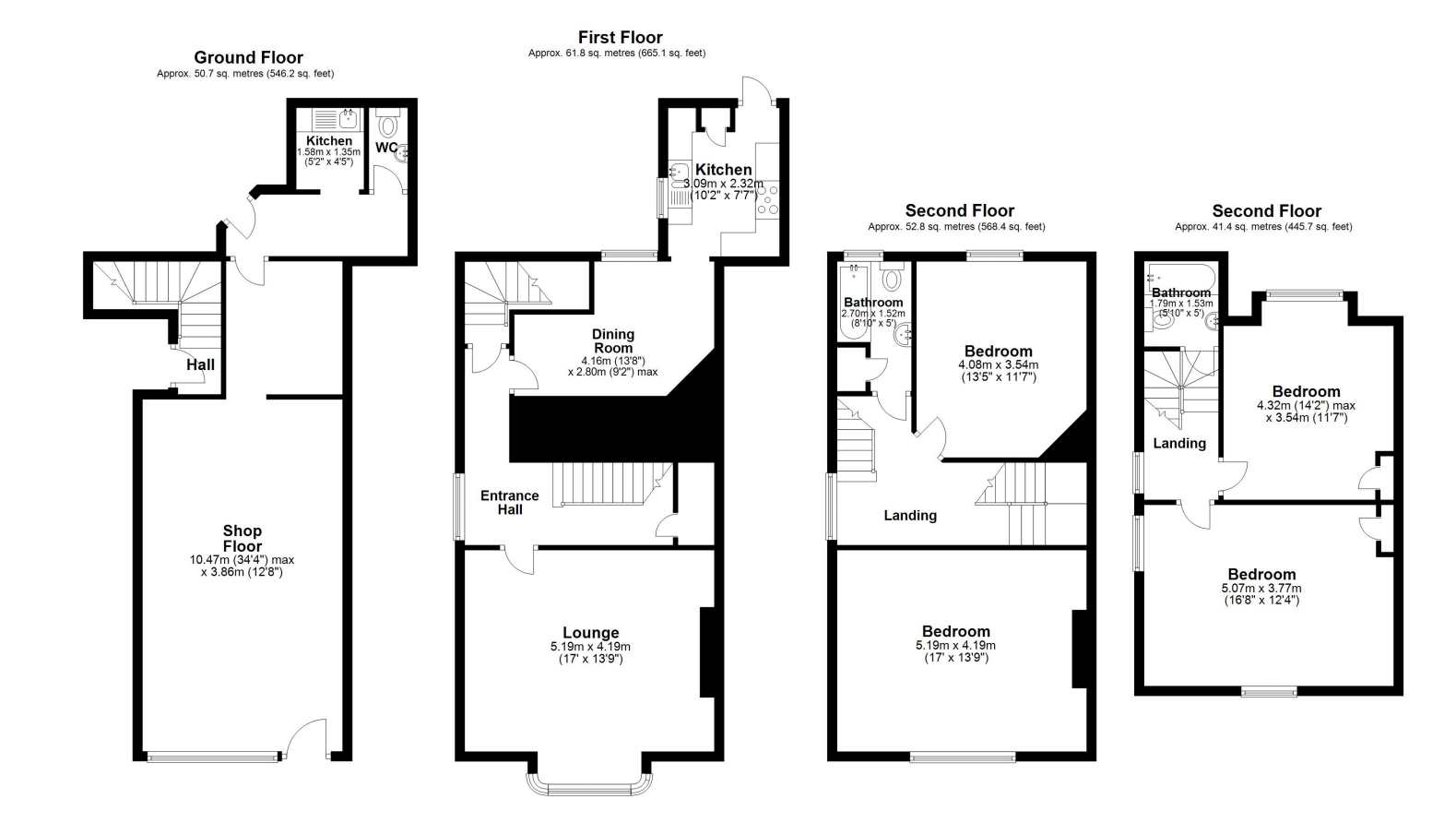
Total area: approx. 206.7 sq. metres (2225.4 sq. feet) Whilst every attempt has been made to ensure the accuracy of the floor plan contained here, measurements of doors, windows, rooms and any other flems are approximate and no responsibility is taken for any error, omission or mis-statement. This plan is for illustrative purposes only and should be used as such by any prospective purchaser. Plan produced using PlanUo.