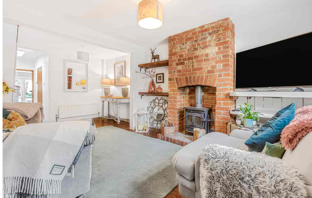
8 Wycombe Road, Marlow, Buckinghamshire SL7 3HU £485,000 - Freehold