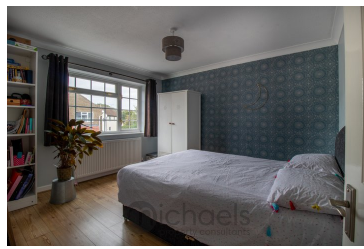
11'10" \times 10'8" (3.61m x 3.25m) With window to front, radiator.