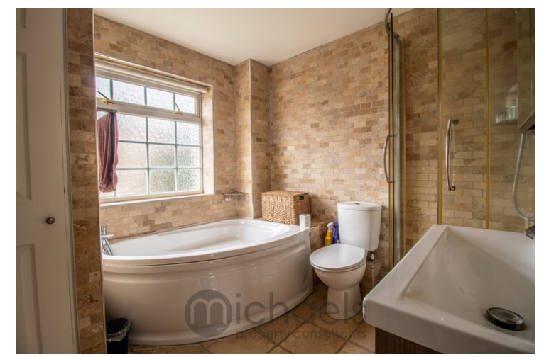
With obscure window to rear, tiled suite offering enclosed shower cubicle, bath, wash hand basin and close coupled WC.