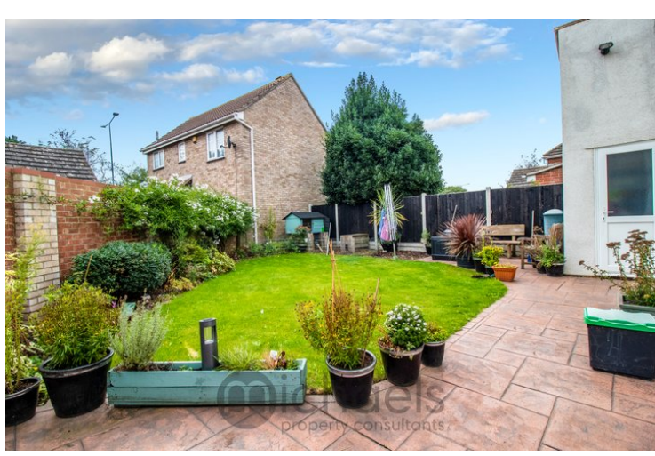
Enclosed garden offering a patio area leading to lawn. Enclosed by brick wall and fencing with gated access.