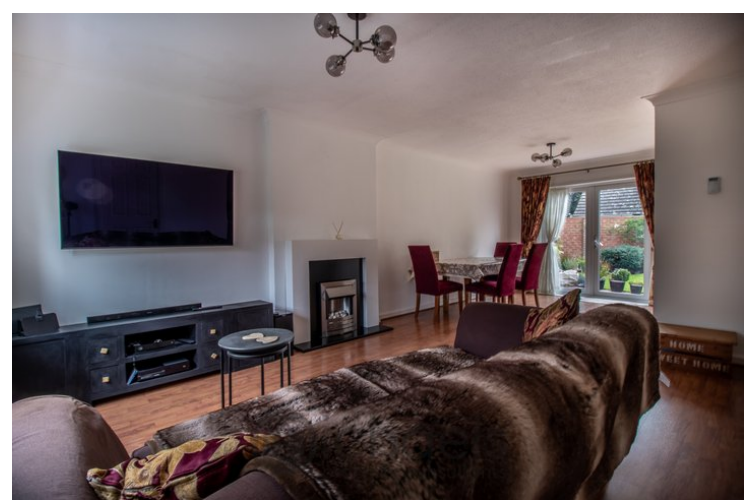
23' 4" x 12' 9" (7.11m x 3.89m) With window to front, French doors to rear, stairs to first floor, two radiators, storage cupboard, door to;