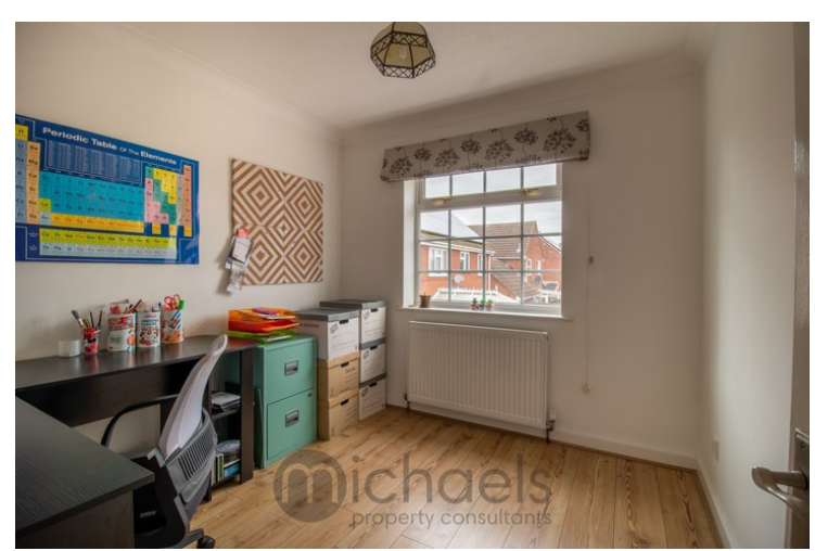
8' 7" x 8' 8" (2.62m x 2.64m) With window to front, radiator.