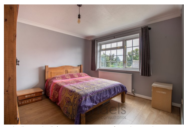
11'3" \times 10'8" (3.43m x 3.25m) With window to rear, radiator.