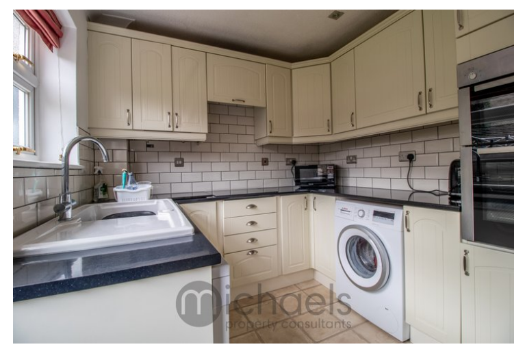
9' 10" x 7' 11" (3.00m x 2.41m) With window and door to rear, radiator, a range of matching eye level and base units with drawers and worktops over, inset sink and drainer, in-built oven, hob and extractor, space for kitchen appliances.