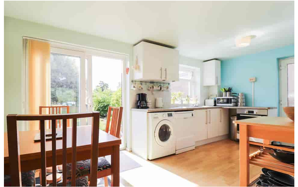
Buttmead, Blisworth, Northampton NN7 3DQ Offers Over £300,000 - Freehold