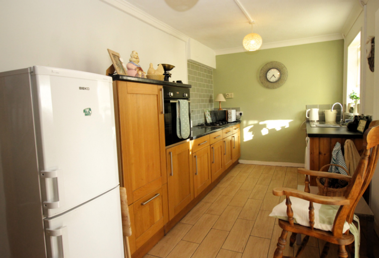
1 Pound Field, Llantwit Major, Vale Of Glamorgan, CF61 1DL

Tel No 01446 794433. E-Mail info@brightermoves.co.uk Web www.brightermoves.co.uk