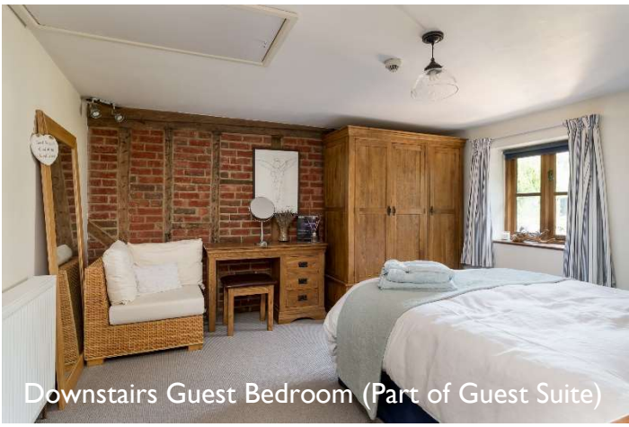
Downstairs Guest Bedroom (Part of Guest Suite)