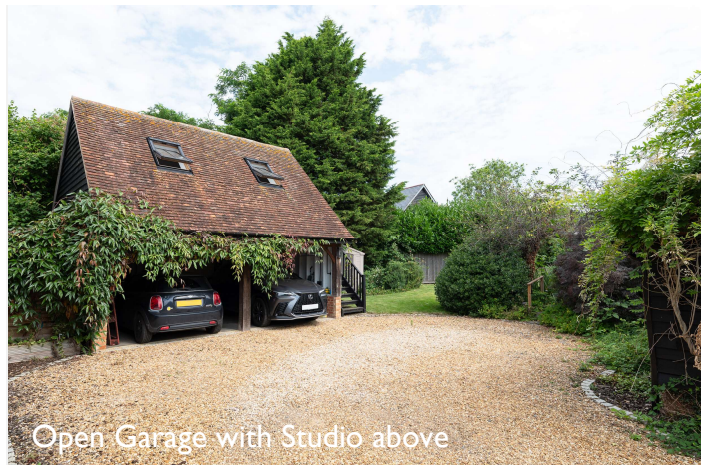
Open Garage with Studio above