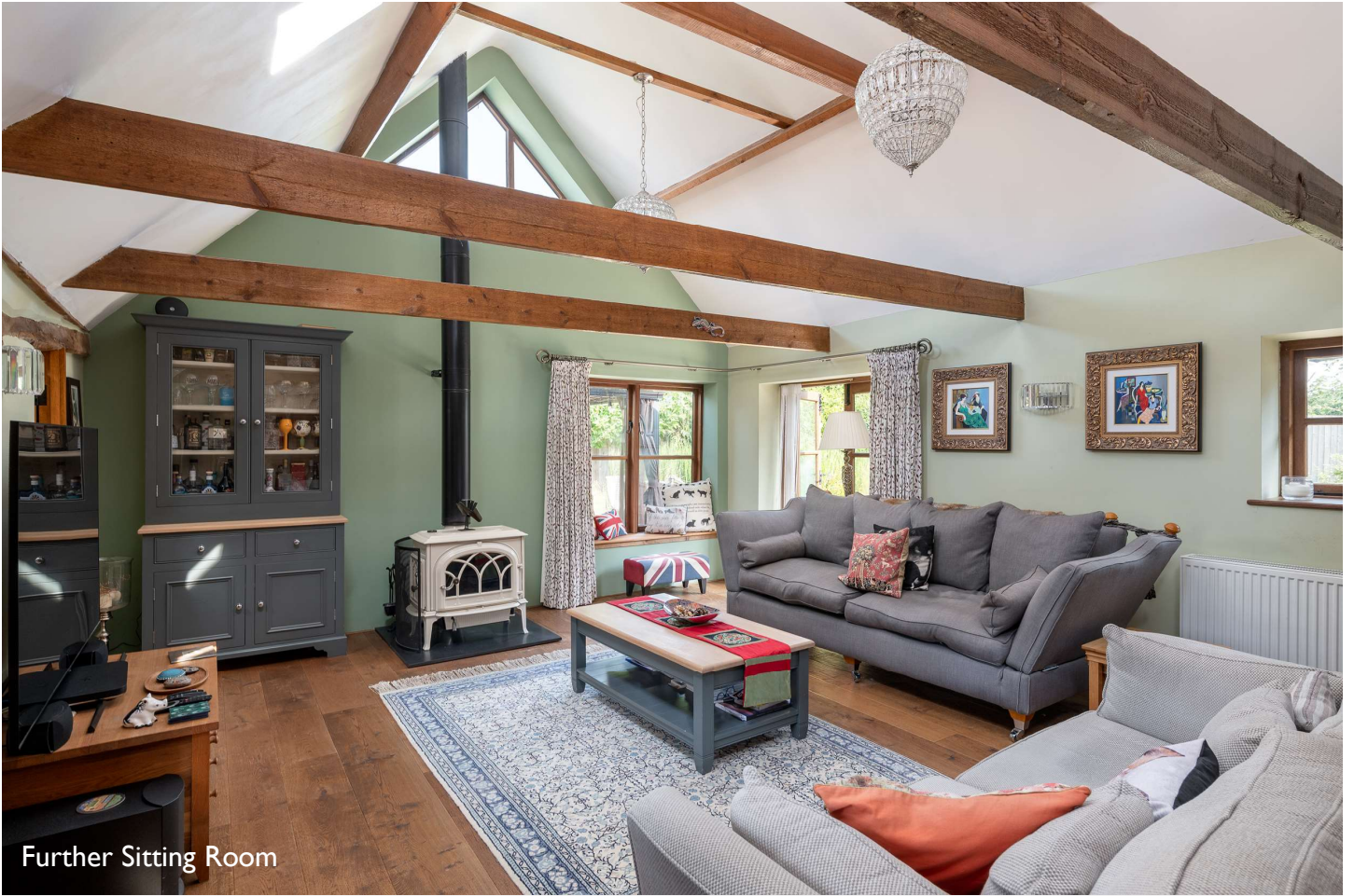
Further Sitting Room