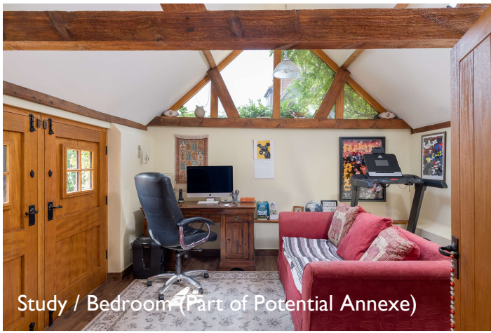
Study / Bedroom (Part of Potential Annexe)