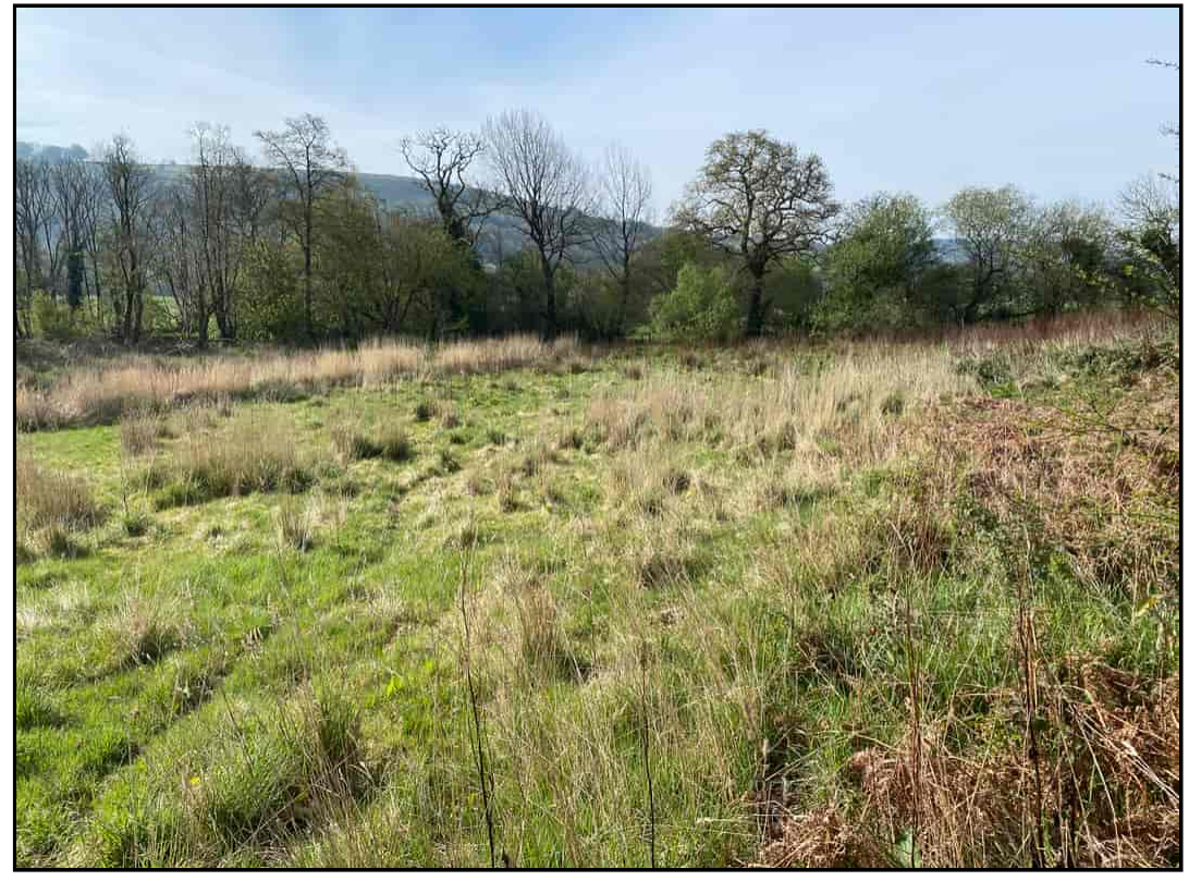
A rare opportunity to acquire a parcel of 4.464 acres pf agricultural land bordering the River Teifi with hard based yard area set off a council road, Lampeter, West Wales

Estate Agents | Property Advisers Local knowledge, National coverage