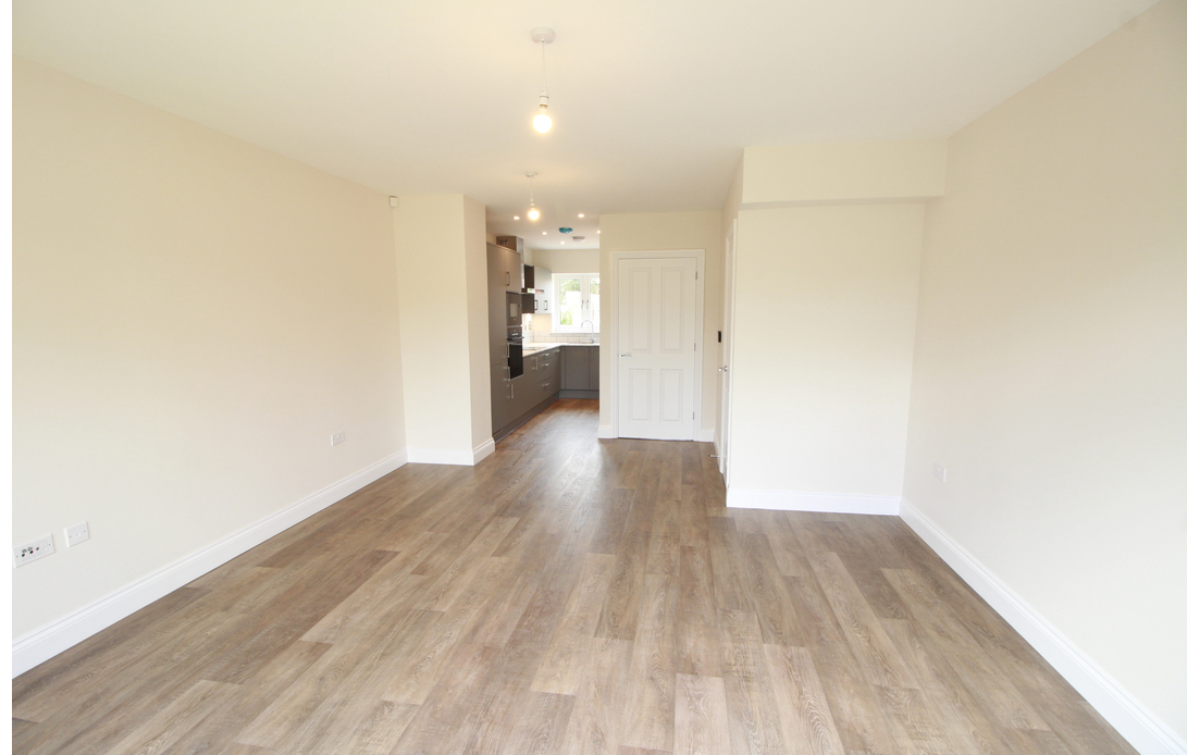
Plot 5, 115 Feltham Hill Road, Ashford, Surrey TW15 1HE £484,950 - Freehold