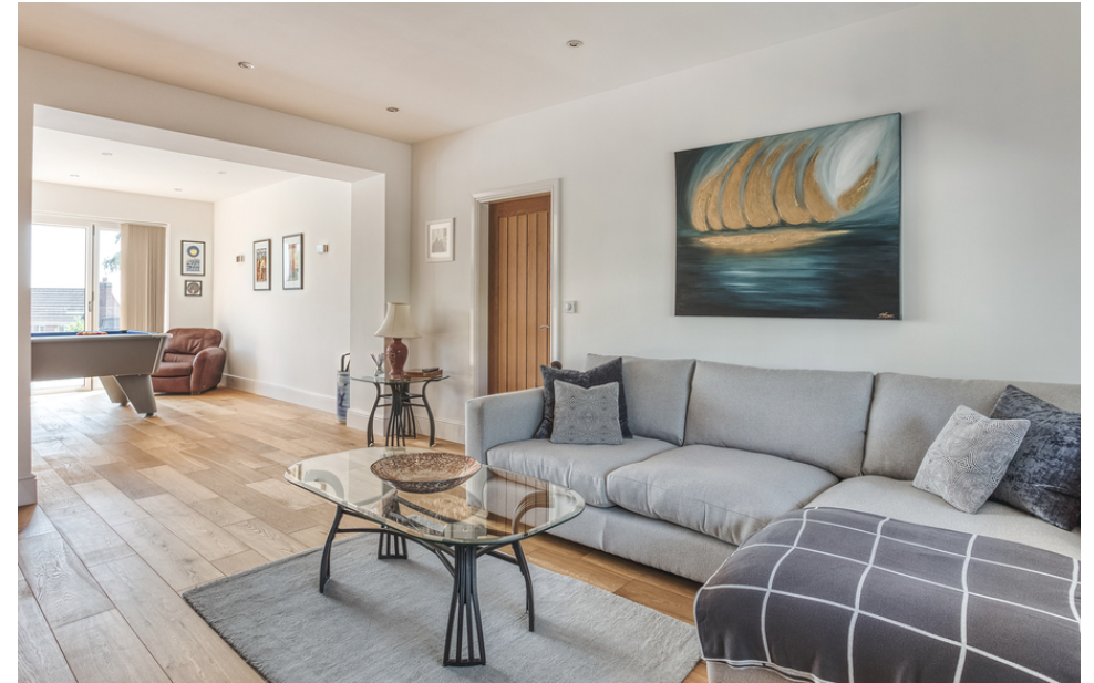
Far Laund, Belper, Derbyshire DE56 1FN £775,000 - Freehold