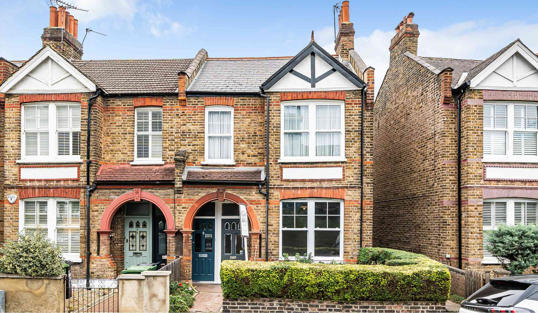
Emlyn Road, London, W12 9TB