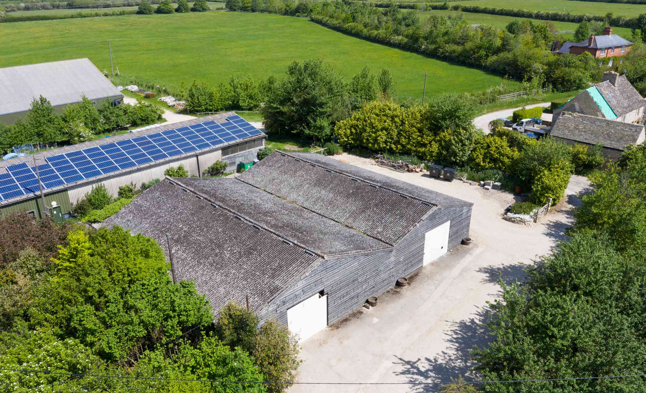
Farm Building for Conversion, Bampton