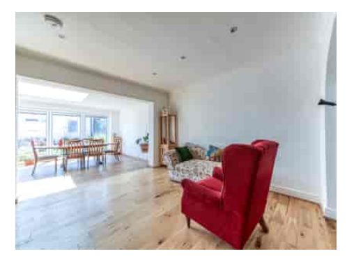
Manor Road, Mitcham, Surrey, CR4 1JA