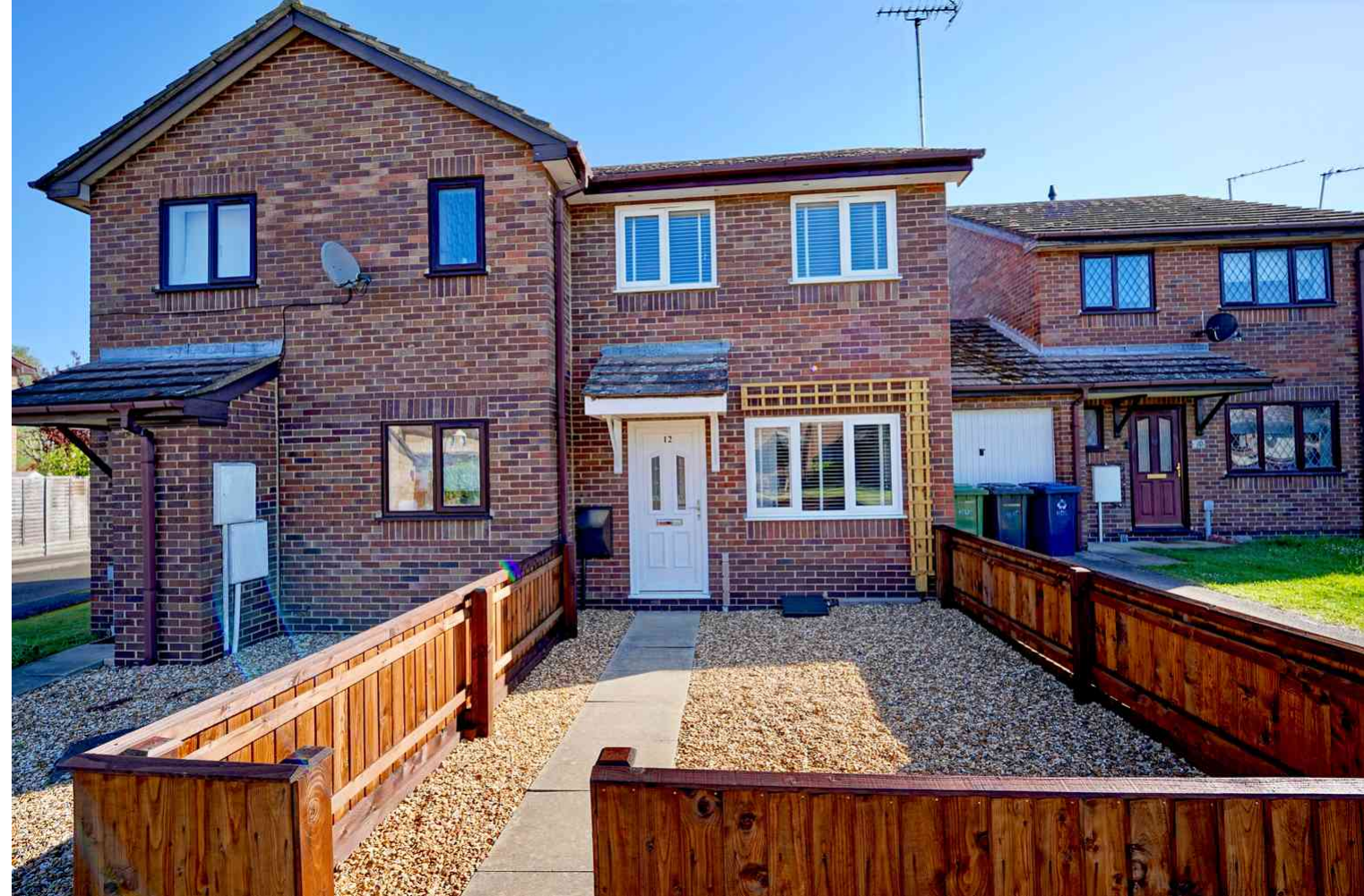
Bassenthwaite, Stukeley Meadows PE29 6UL