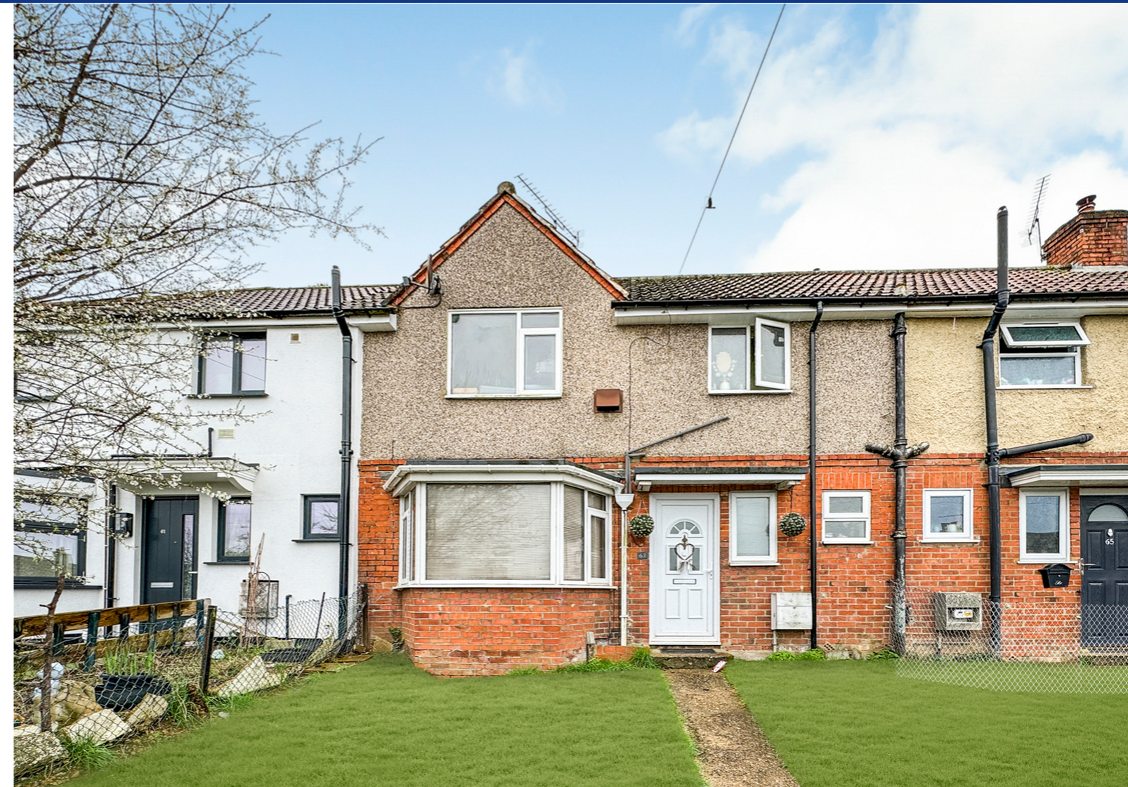
Lyndhurst Road, Tilehurst, Reading.