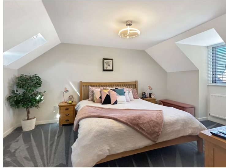
12' 4" x 12' 1" (3.76m x 3.68m) Velux windows, radiator, storage cupboard.