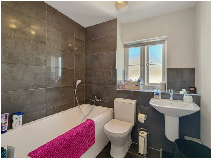
Double glazed obscure window to front, part tiled walls, tiled floor, low level WC, paneled bath, wash hand basin, towel rail.