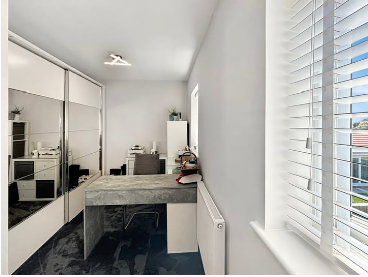
15' 11" x 8' 0" (4.85m x 2.44m) Double glazed windows to rear, radiator.