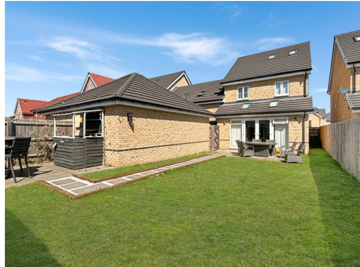
A generous south facing rear garden, patio area, with the remainder laid to lawn, retained by fencing with side gated access.