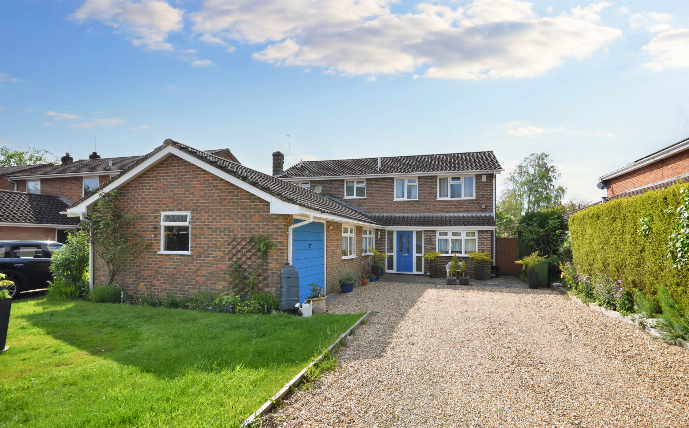
4 The Boreen, Headley Down, Near Grayshott, Hampshire. GU35 8JY. Offers Over £725,000