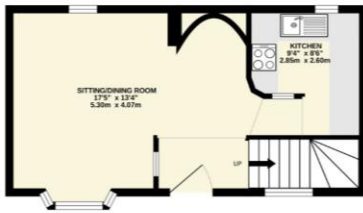
GROUND FLOOR 347 sq. ft. (32.3 sq.m.) approx.