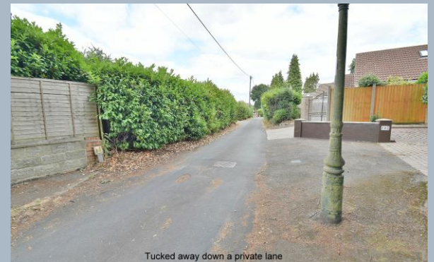
Tucked away down a private lane

AGENTS NOTES: The heating system, mains and appliances have not been tested by Hearnese Estate Agents. Any areas, measurements or distances are approximate. The text, photographs and plans are for guidance only and are not necessarily comprehensive. Whilst reasonable endeavours have been made to ensure that the information in our sales particulars are as accurate as possible, this information has been provided for us by the seller and is not guaranteed. Any intending buyer should not rely on the information we have supplied and should satisfy themselves by inspection, searches, enquiries and survey as to the correctness of each statement before making a financial or legal commitment. We have not checked the legal documentation to verify the legal status, including the leased term and ground rent and escalation of ground rent of the property (where applicable). A buyer must not rely upon the information provided until it has been verified by their own solicitors.