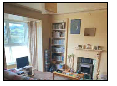
Llangeitho Stores Caffi a Siop Llangeitho, Tregaron, Ceredigion. SY25 6TL.