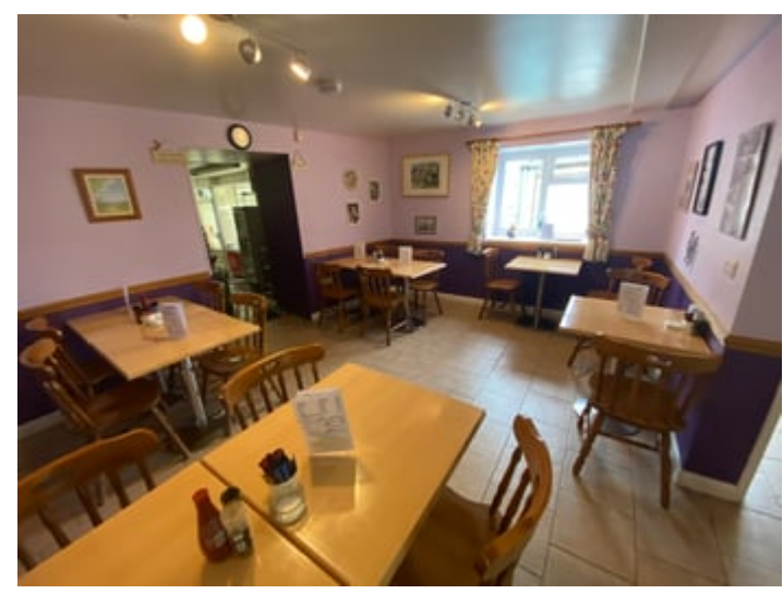
15' 6" x 30' 4" (4.72m x 9.25m) overall with covers for 16 with tables and chairs .