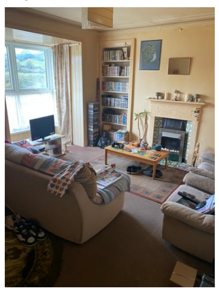
14' 8" x 11' 4" (4.47m x 3.45m) with feature Victorian fireplace, radiator. Bay window overlooking the village green.