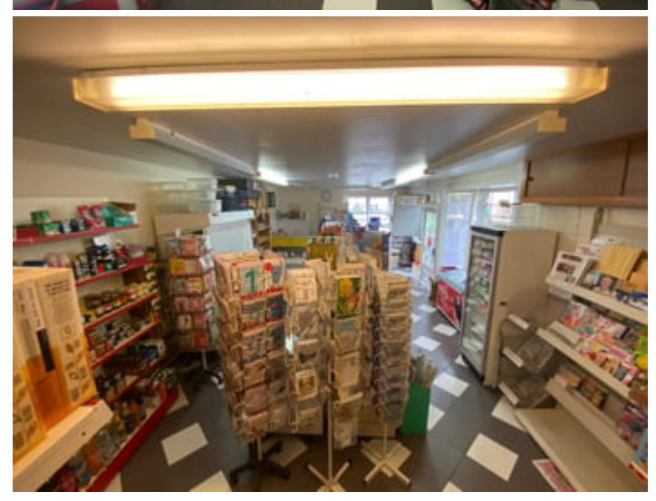
29' 10" x 15' 2" (9.09m x 4.62m)