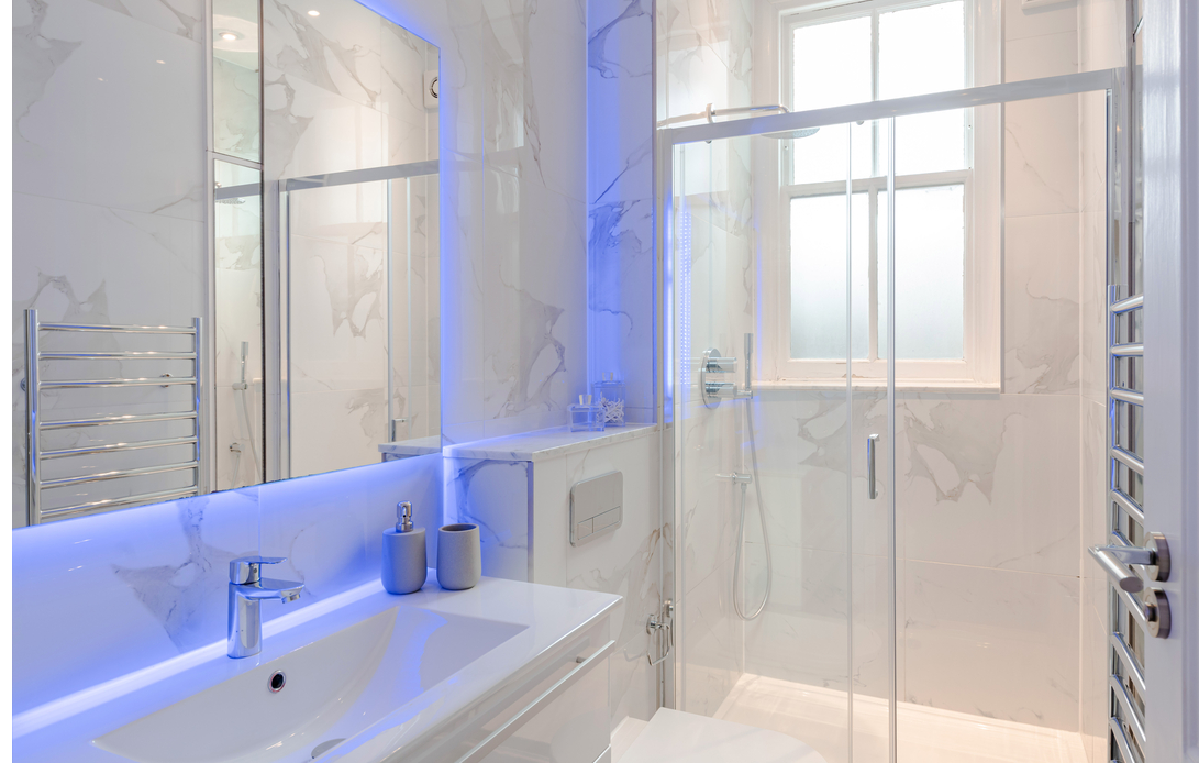
83-85 Flat 3, Queen's Gate, South Kensington, London, SW7 5JX £1,650,000 - Leasehold