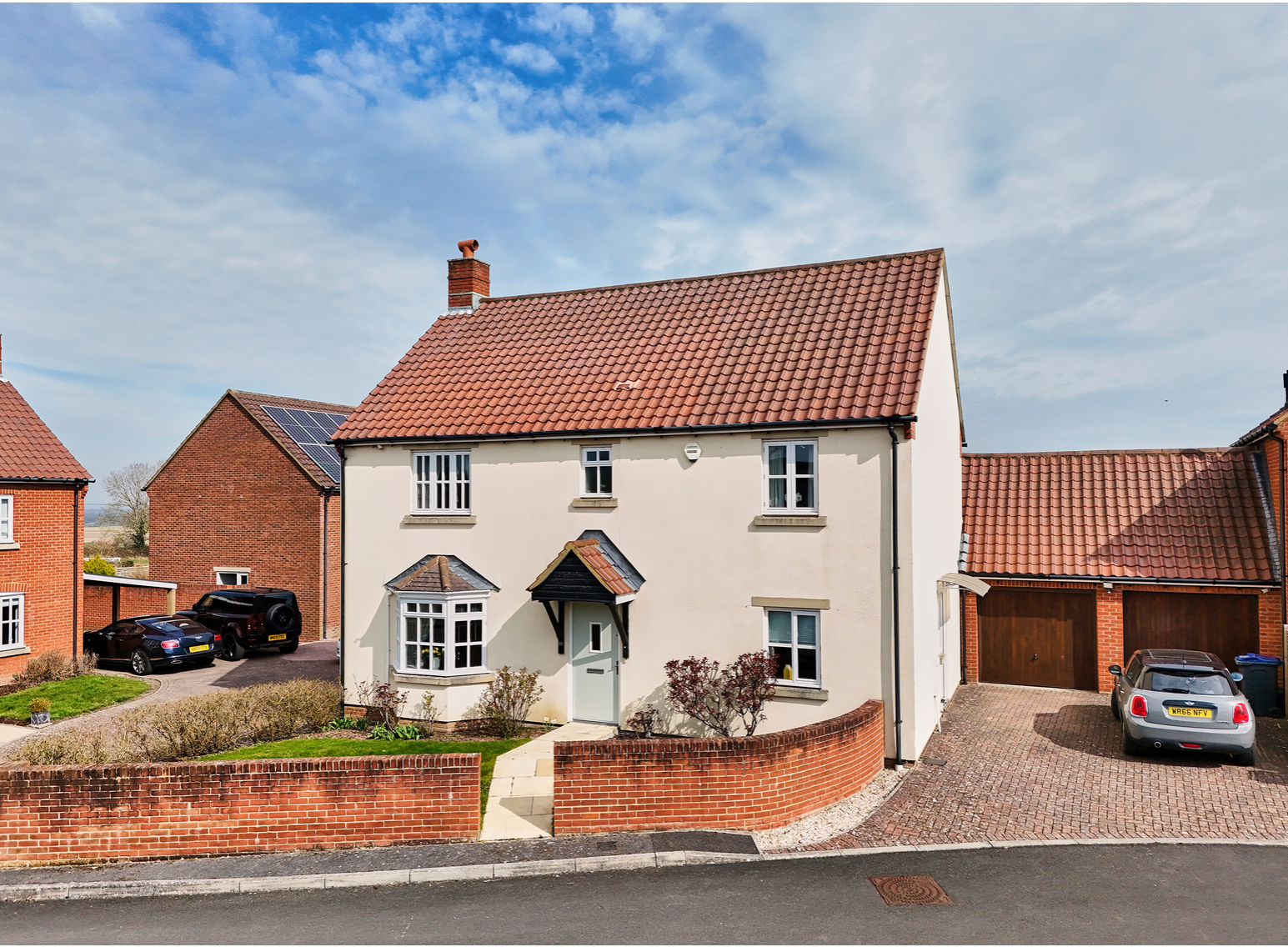
12 Shepherds Drove, West Ashton