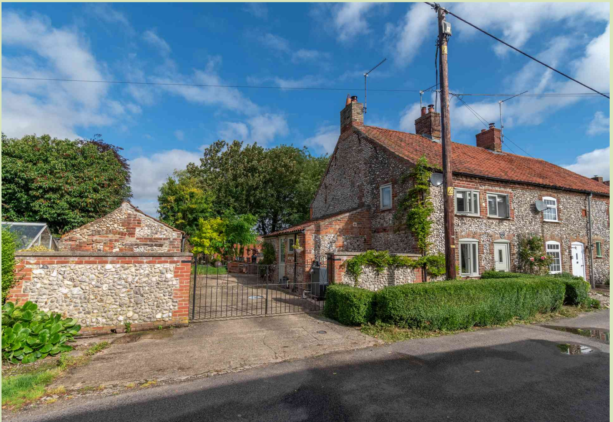
Nutmeg Cottage, East Rudham Guide Price £340,000