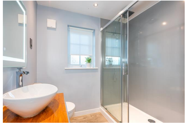
FAMILY SHOWER ROOM

OUTSIDE Block paved drive to the front providing parking for multiple vehicles, lawned garden, gravelled borders and external sockets. Landscaped, lawned rear garden with paved patio, metal shed, outside tap and borders housing a variety of shrubs, bushes and trees.