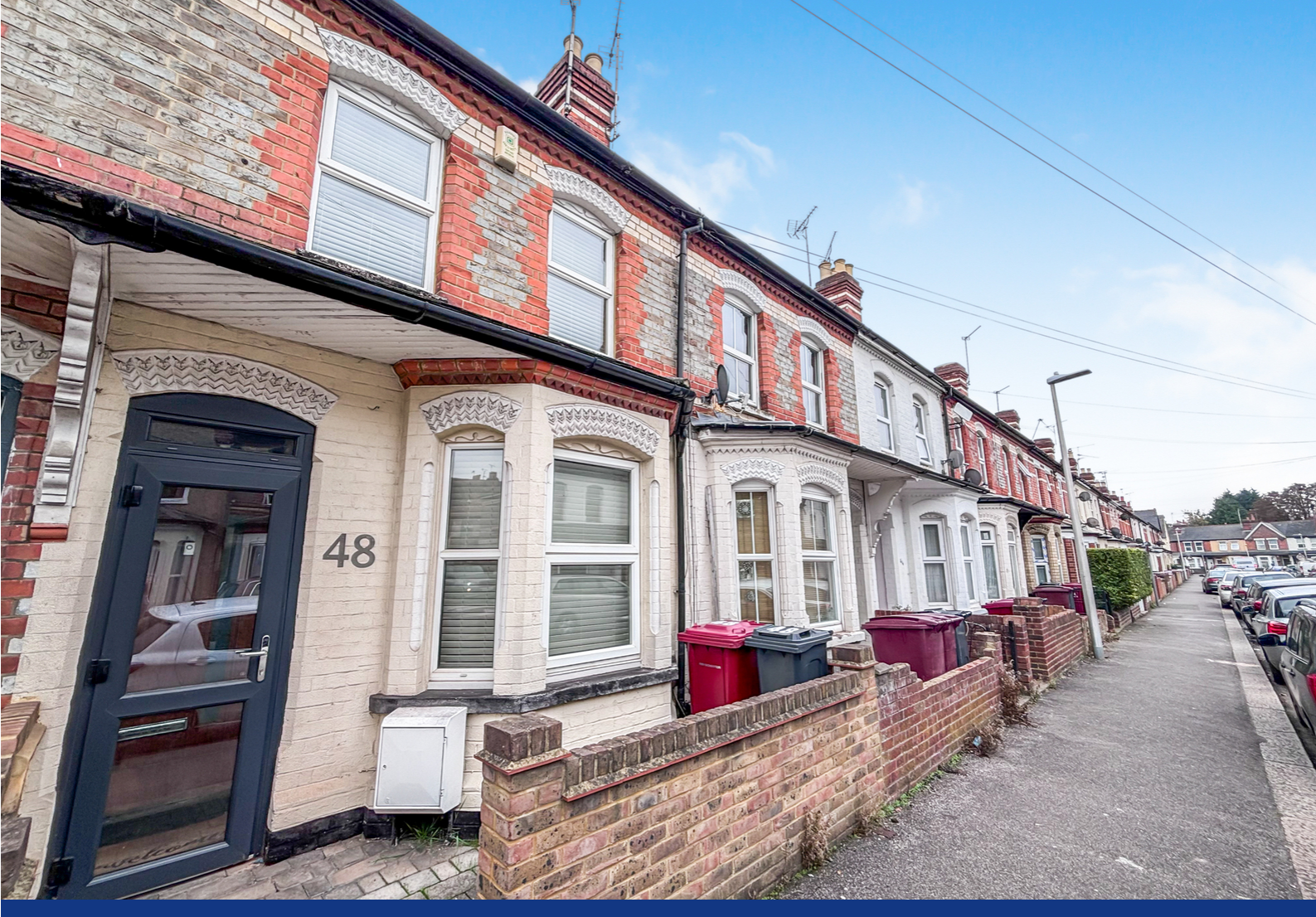
Catherine Street, Reading, Berkshire.