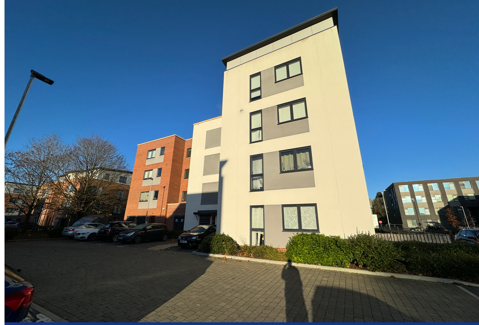
Ruhemann Street, Reading, Berkshire.