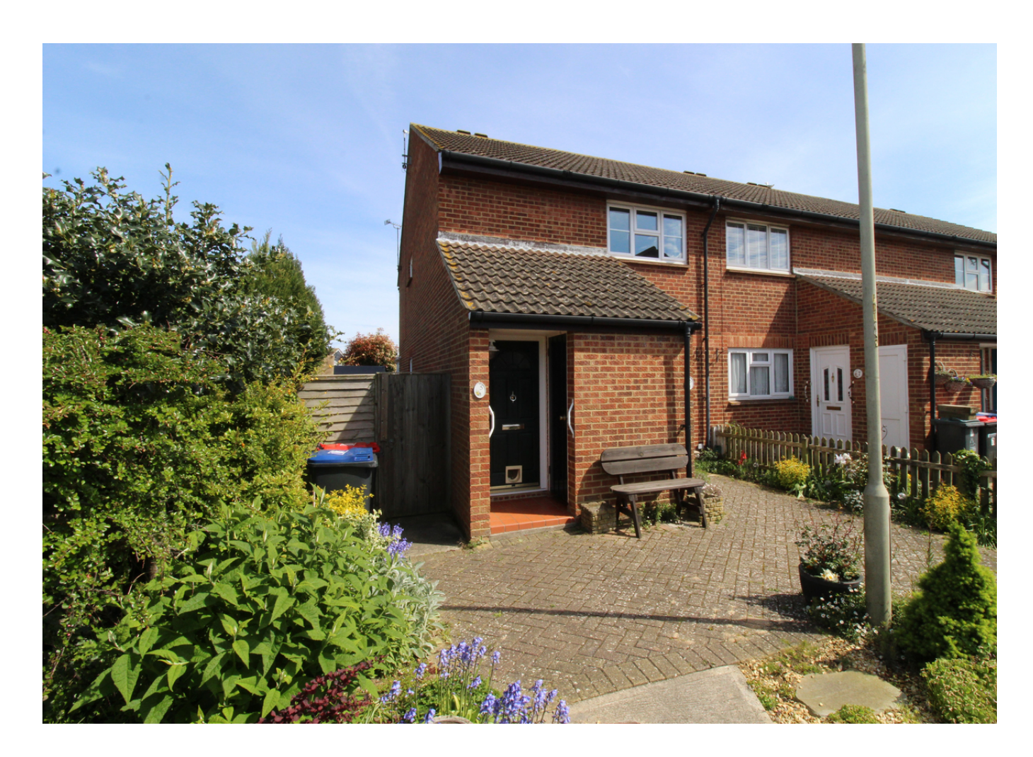
5 Plough Court, Herne Bay, Kent, CT6 7XA