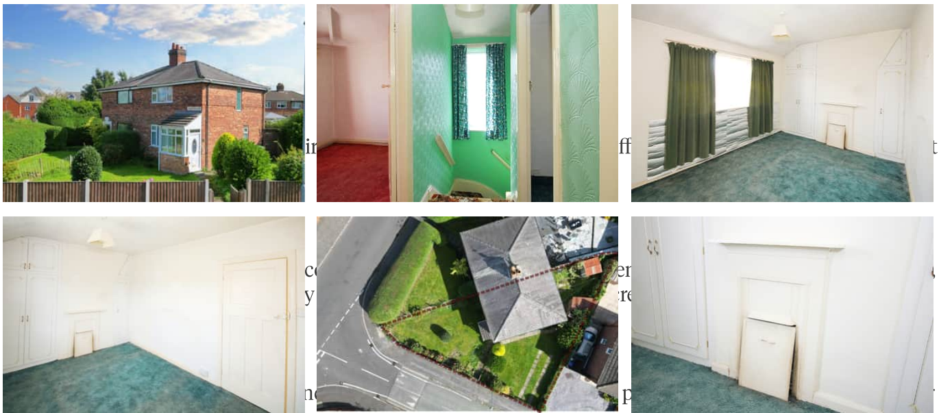
those looking for extra room.

Are you ready to unlock the potential of your dream home? Look no further! We are thrilled to present this incredible three-bedroom semi-detached property nestled on a generous corner plot in the highly sought-after neighborhood of Bewsey, Warrington.