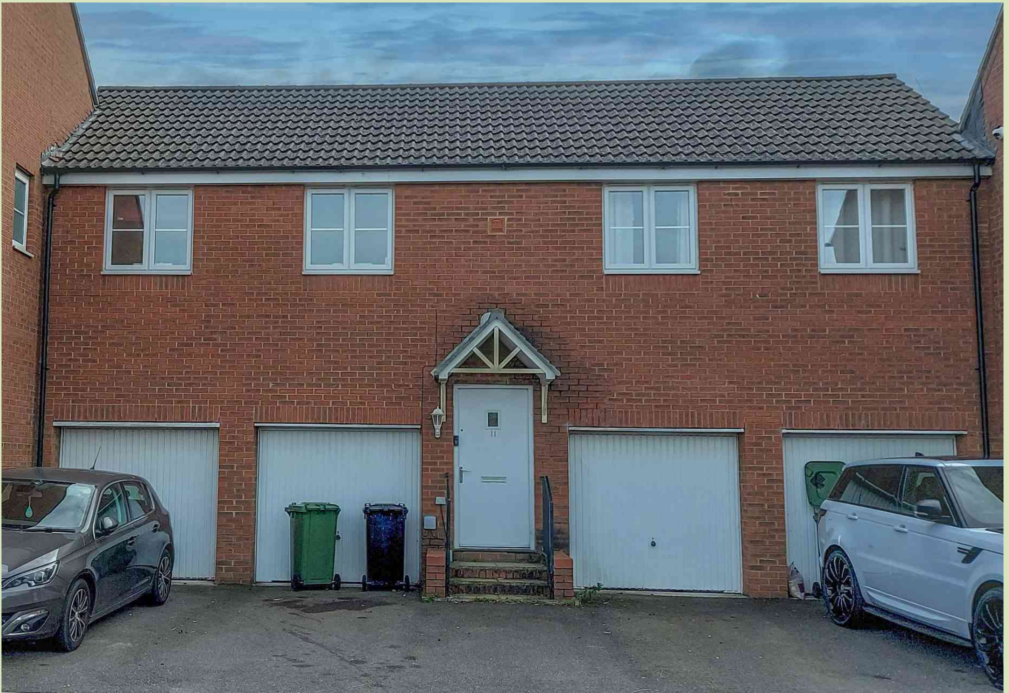
11 Riverview Way, King's Lynn Guide Price £179,950