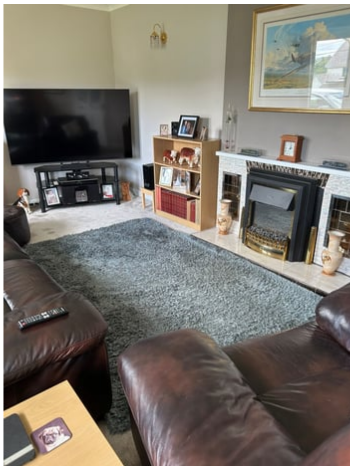
LIVING ROOM (FOURTH IMAGE)