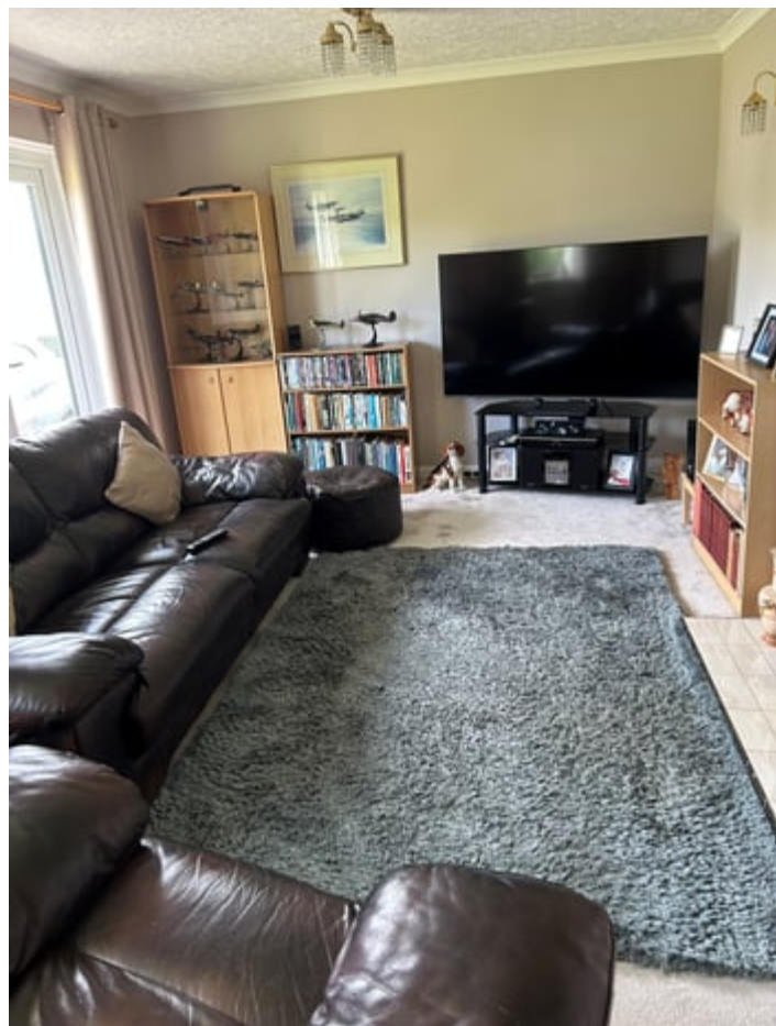
LIVING ROOM (THIRD IMAGE)