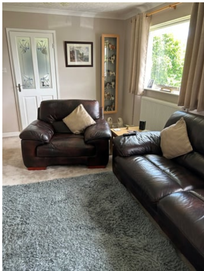
LIVING ROOM (SECOND IMAGE)