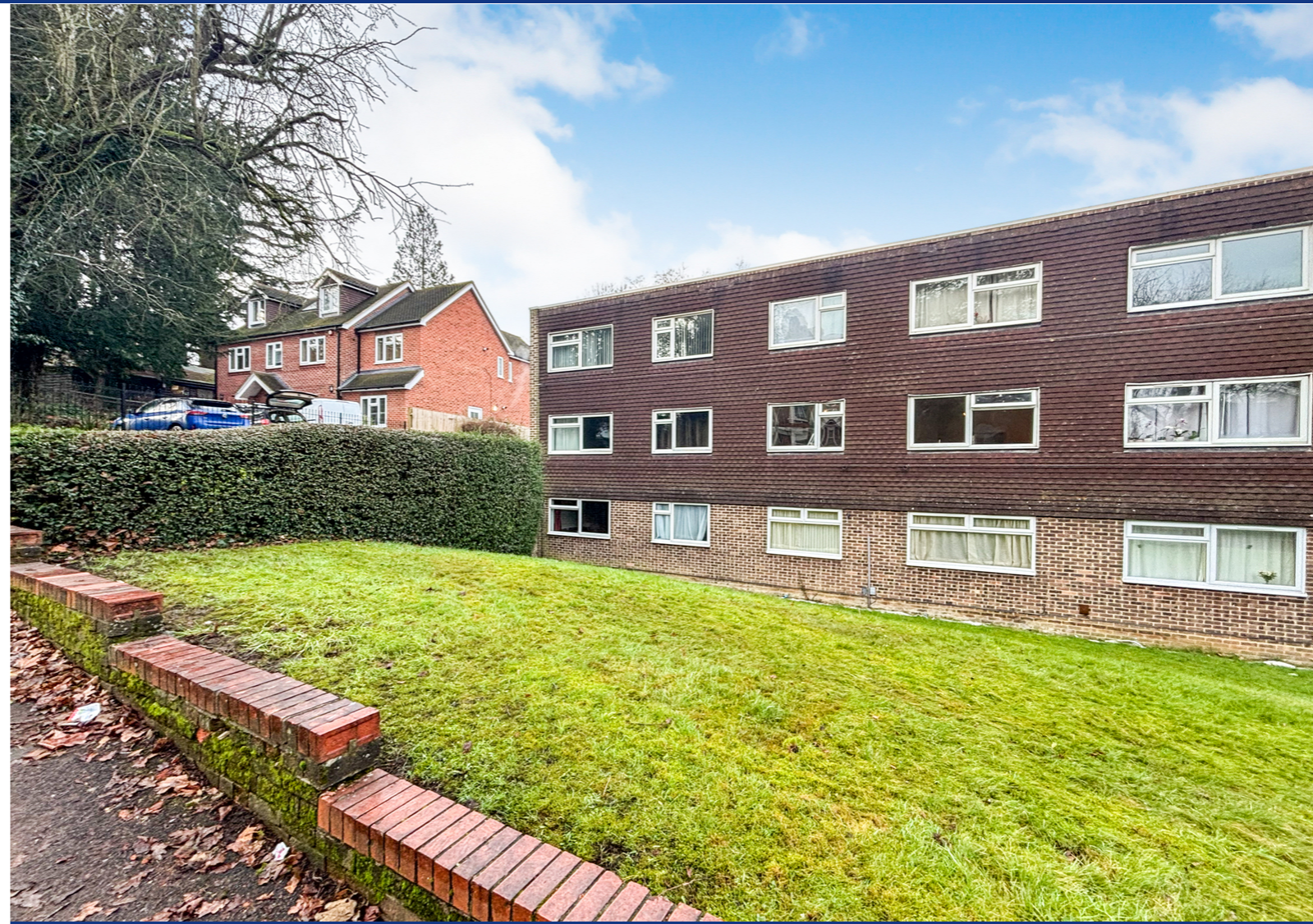
Baron Court, Reading, Berkshire. RG30 2BP.