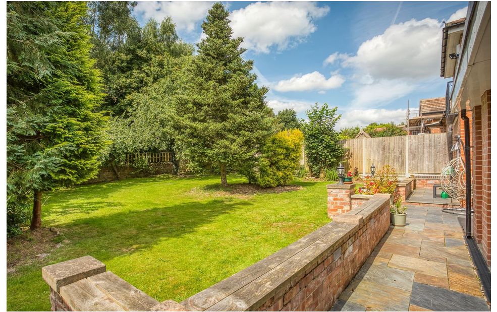
Burley Hill, Allestree, Derby DE22 2ET £999,950 - Freehold