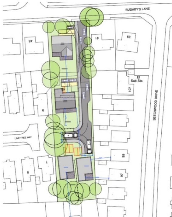
Location Plan and Indicative Layout for Planning

Existing Property Layout Total area: approx. 178.9 sq. metres (1925.5 sq. feet) This floorplan is for illustrative purposes only and is not to scale. Plan produced using PlanUp.