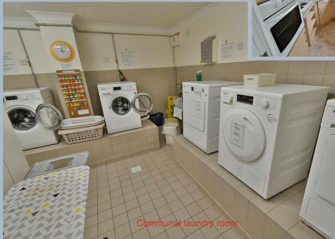
Communal laundry room